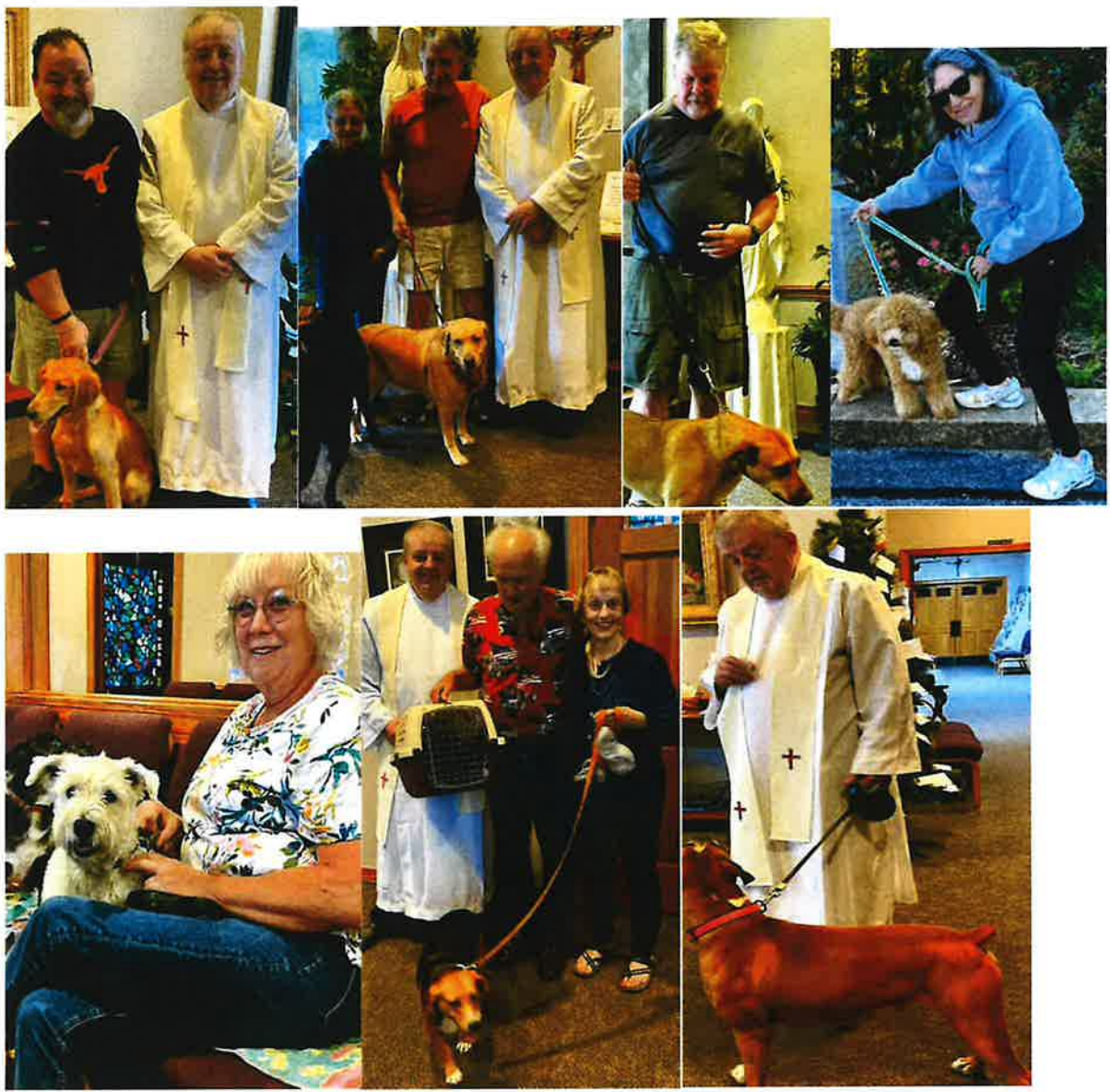
FEW OF THE ST. FRANCIS OF ASSISI FOLLOWERS FROM HOLY SPIRIT CATHOLIC CHURCH