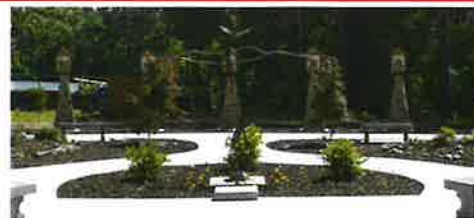
Holy Spirit Meditation Garden