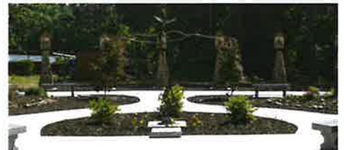
Holy Spirit Meditation Garden

We hear the magnificent story of Jesus' transfiguration.