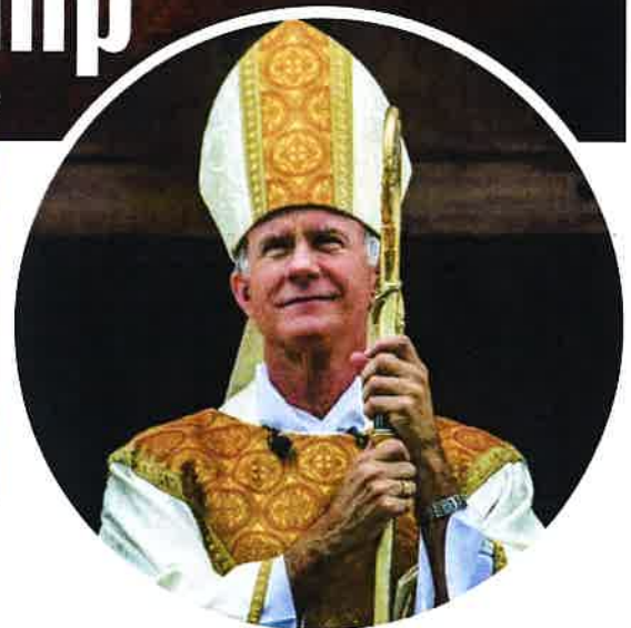
Bishop Joseph Strickland