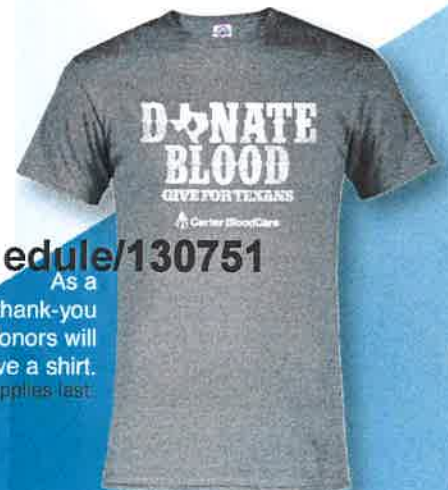
PHOTO ID REQUIRED

ww3.greatpartners.org/donor/schedules/drive_schedule/130751