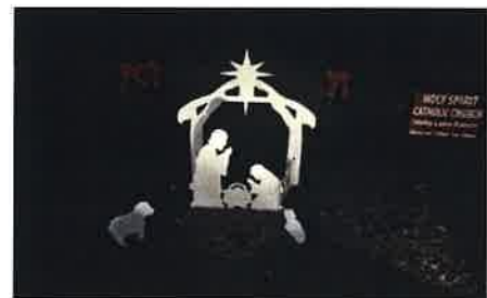
Picture of Display

There is also a Christmas display set up by the Welcome Committee on the walking trail in Holly Lake Ranch by the fitness center and pickle ball courts. If you have an opportunity enjoy the trail after dark and find the Holy Spirit display.