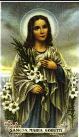
St. Maria Goretti Feast Day July 6th